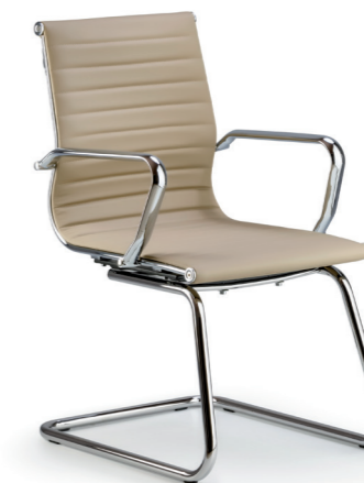
KARMA EXECUTIVE CHAIR