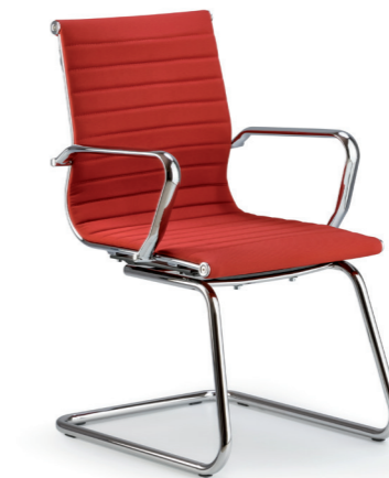
KARMA EXECUTIVE CHAIR