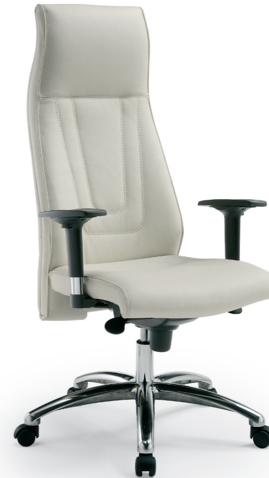
SPHERA EXECUTIVE CHAIR